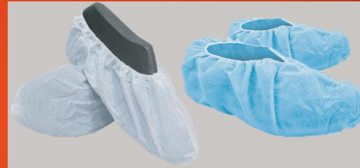
Disposable over shoes