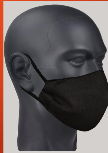
Fabric Face Mask