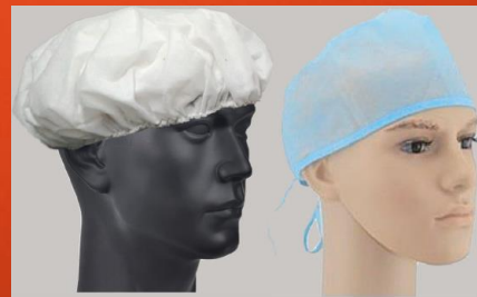
Disposable Mop Caps

(PLEASE NOTE: Printing on all masks is available at additional small cost!)