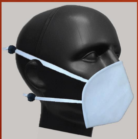
Cone Moulded Respirator