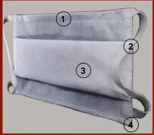
Pleated 3-Ply Non-woven