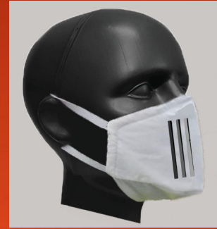
3-Ply Chin Strap